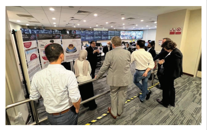
Exploring TTSH C3 Operations Command Centre