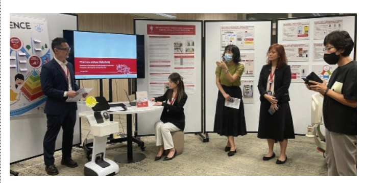
A demonstration and sharing on Pharmacy-Without-Walls

The delegation was in Singapore to explore collaborative opportunities and strengthen ties between our countries. They visited NCID to understand its role during peacetime and outbreak, and its building designs. The delegation also had the opportunity to hear about CHI's approach to systems level innovation, how 3P Lean Design was applied in plans for NCID. The also experienced key facilities such as TTSH's Operations Command Centre, and the CHI Reimagination Plaza which showcased initiatives to illustrate "Hospital without Walls" Digitalisation Strategy. Click here for more.