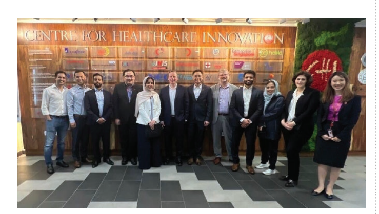
The KSA Biotechnology Delegation

The delegation learnt about CHI's vision to translate innovation into practice, TTSH's Operations Command Centre and the "Hospital without Walls" Digitalisation Strategy. With the Kingdom embarking on their Healthcare Sector Transformation Plan 2030, we look forward to more learnings and exchanges with them! Click here for more.