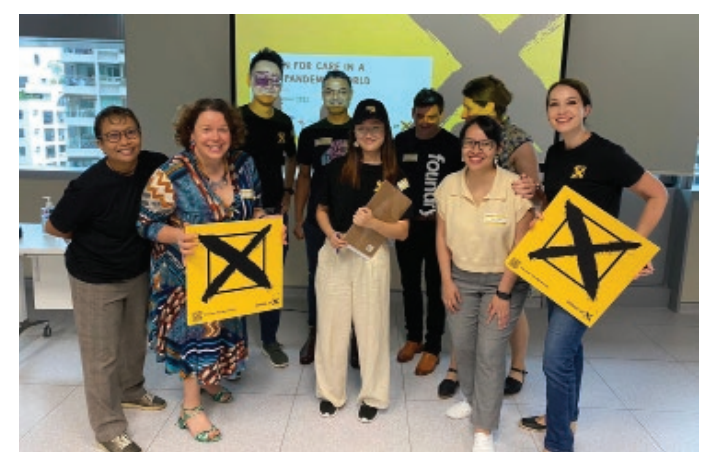
QUT participants and the School of X Team