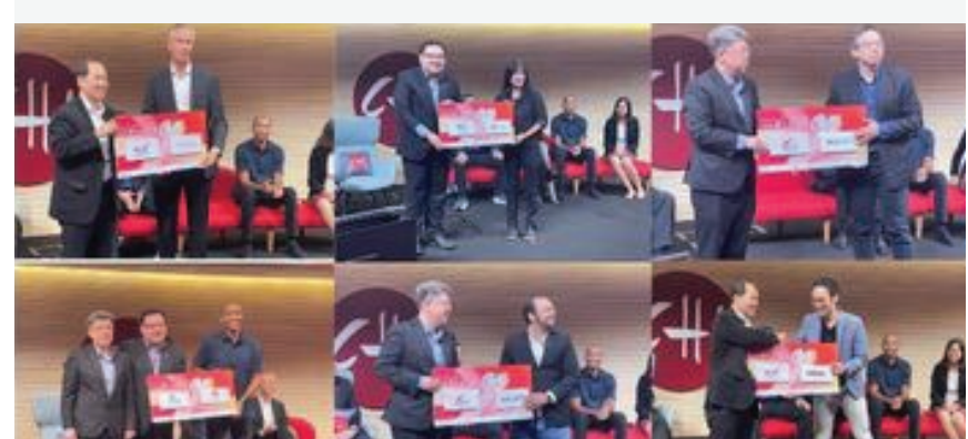
Healthcare InnoMatch 2022 Winners

Six innovations awarded a total of S$2.4 million at Healthcare InnoMatch 2022 to accelerate healthcare transformation!